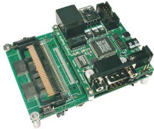
Figure 3 - Stargate Mid-tier Processing Node

device requirements. First, these nodes serve as aggregation points for ever larger geographic regions, resulting in an increase in the number of streams being monitored and the aggregate data volume to be processed. Secondly, many applications will need to archive streams and provide access to that past data. Thus, diskful systems will be required. Finally, the availability of large volumes of both live and historical stream data will make such systems magnets for queries from throughout the network.