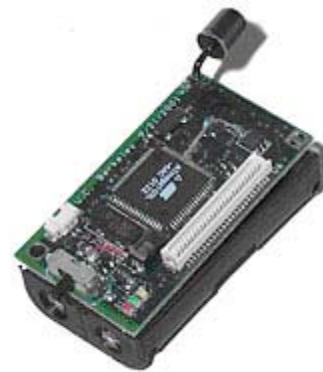
Figure 2 - Berkeley Mica Wireless Sensor Mote

Resources – Finally, the range of computing resources available at various levels of a High Fan-in system also vary dramatically, from small, cheap sensor motes (e.g., Berkeley Motes, see Figure 2) on the edges up to the largest mainframes in the interior of the system. Communication resources also can range from low power, lossy radios at the edges, to dedicated high-speed fiber in the interior.